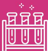
IN VITRO DIAGNOSTICS