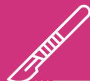
SURGICAL & CLINICAL EQUIPMENT