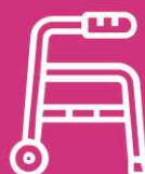
PERSONAL CARE & ASSISTED LIVING